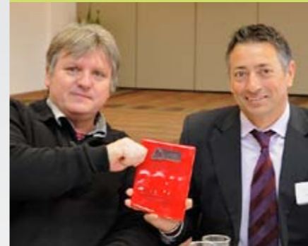
Schiavello proudly receive their award.