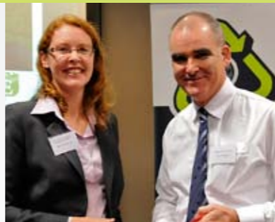
Canberra Stadium proudly receive their award.