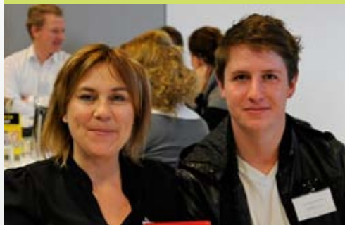
Greenhouse Emporium proudly receive their award.