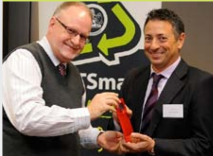
Schiavello proudly receive their award.