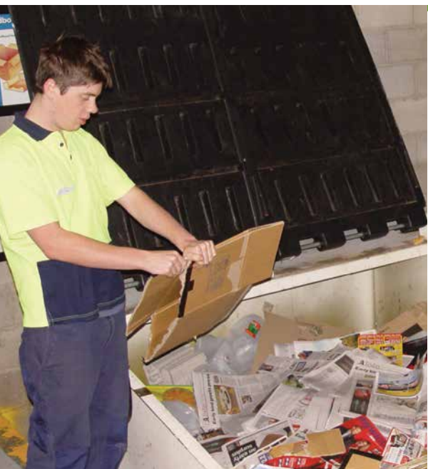
Initial Audit Composition